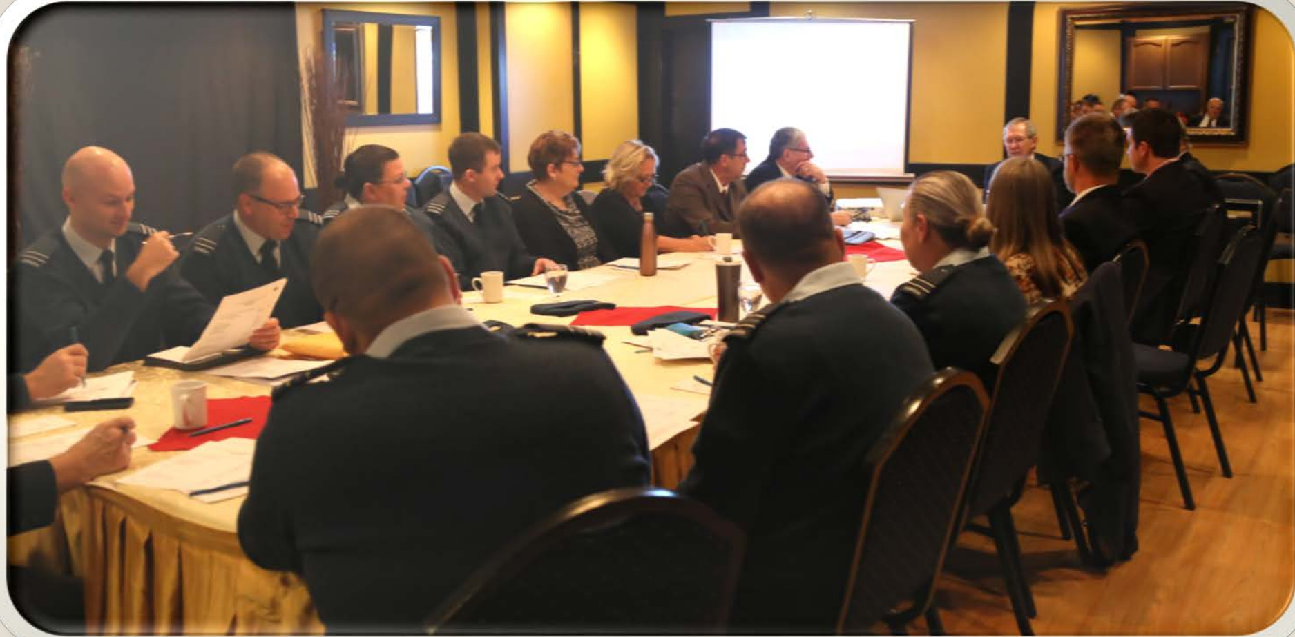
Attendees at the PEI ACL Annual Meeting , October 21, 2017